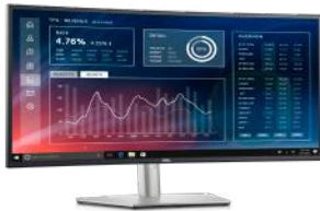
UltraSharp 34 Curved Monitor USB-C Hub - U3423WE

Large Single Display with USB Hub for increased productivity and reduce home office clutter .