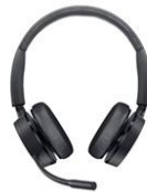
Dell Pro Wireless Headset - WL5022

Large Single Display with USB Hub for increased productivity and reduce home office clutter .