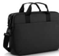
Dell EcoLoop Pro Briefcase - CC5623

Get productive with a quiet, full-size keyboard and mouse combo with programmable shortcuts and 36 months battery life.