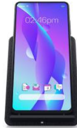
Dell Dual Dock - HD22Q

Experience industry leading video quality and picture clarity in any lighting with this intelligent 2K QHD webcam.