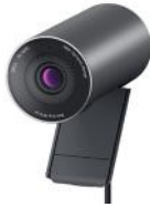
Dell Pro Webcam - WB5023

Stay productive, no matter where you work. Reduce harmful blue light with this sleek 23.8-inch FHD hub monitor with ComfortView Plus.