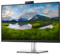
Dell 24 Video Conferencing Monitor - C2423H

Stay in sync on a 24-inch FHD monitor with built-in conferencing essentials, low blue light and an eco-friendly design.