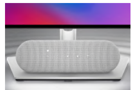
Dell Speakerphone - SP3022

Boost your PC's power up to 90W with ExpressCharge on the world's most powerful and first modular USB-C dock with a future-ready design. 16,17