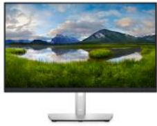
Dell 24 USB-C Hub Monitor - P2422HE

Stay productive, no matter where you work. Reduce harmful blue light with this sleek 23.8-inch FHD hub monitor with ComfortView Plus.